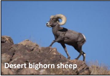
Desert bighorn sheep