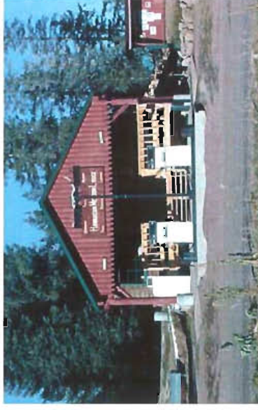
Hannagan Meadow Lodge & Fueling Station

However the most striking manmade feature along the route is located at the southern end of the corridor. It is the impressive Phelps Dodge Corporation Morenci Mine site. This mine is one of the largest open pit mines in the world and is a spectacular display of man's potential effects on the environment. The associated mining features such as the large smelter stacks, concentration plant, rail lines, heavy equipment, waste piles and tailing ponds are also dominant features in this area.