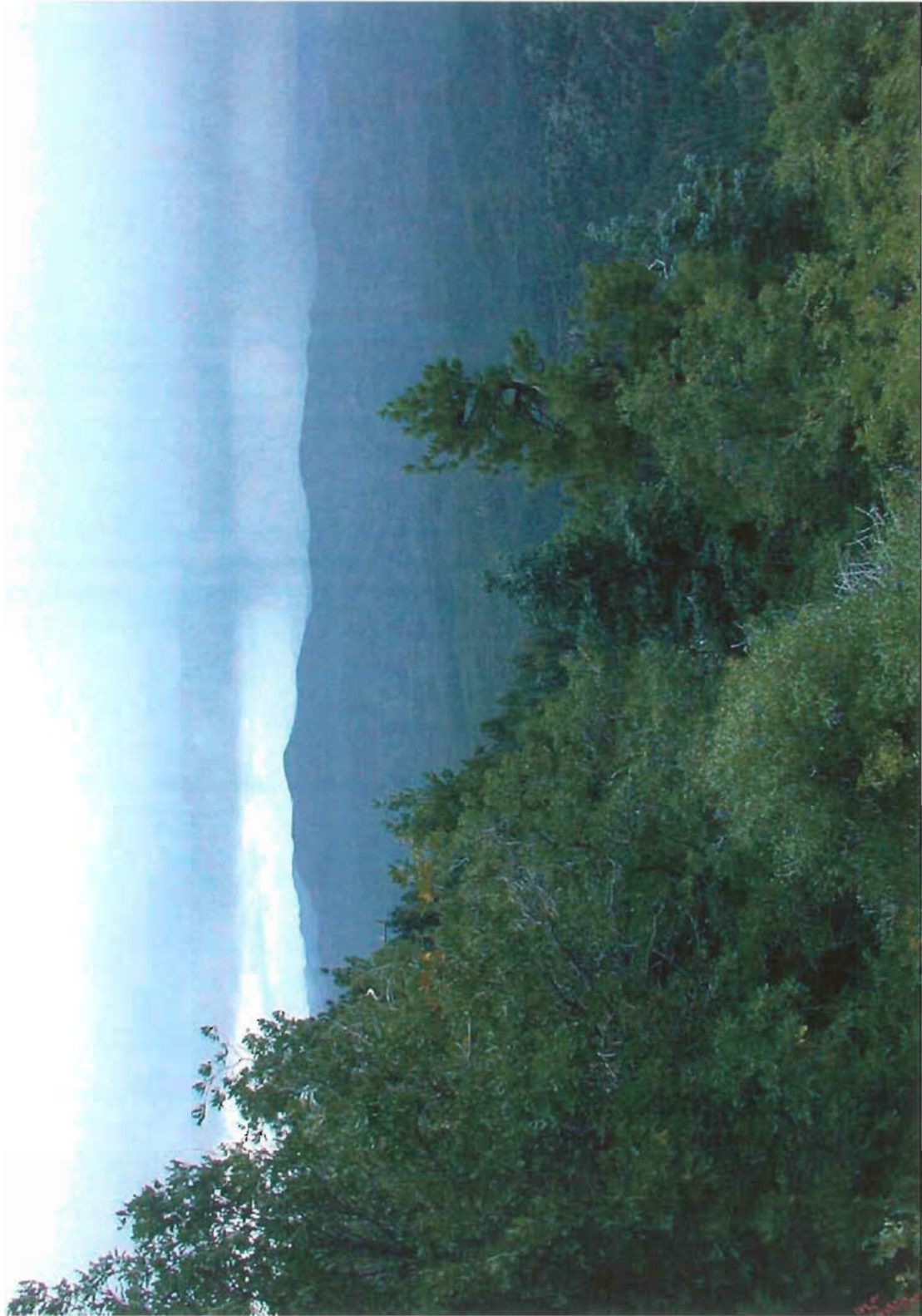
One of many arresting panoramas