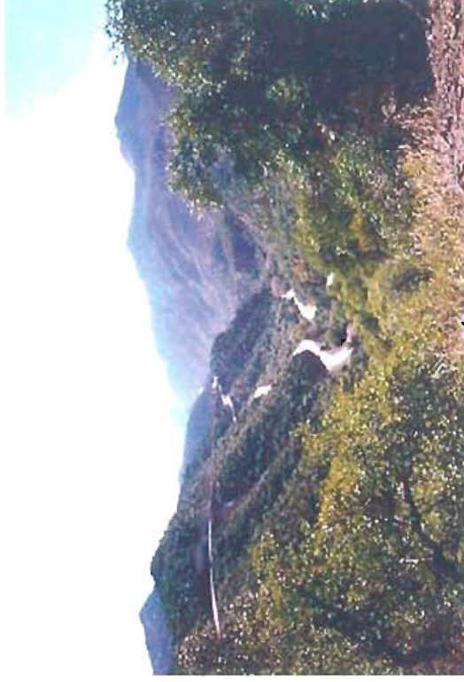
Sixty miles of roadway with over four hundred switchbacks

Almost all of the Coronado Trail Scenic Byway lies within the Apache-Sitgreaves National Forest. From this central forest-lined roadway the U.S. Forest Service provides public access to an inimitable array of opportunities and facilities for hunting, hiking, climbing, camping, biking, horseback riding, and fishing. Other recreational