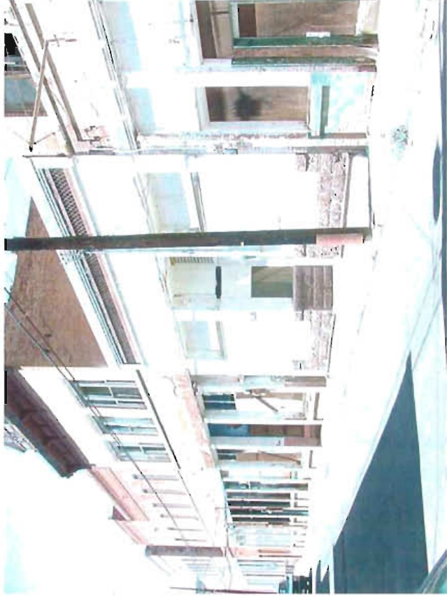
Old Chase Street in Clifton