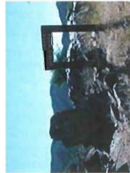
U.S. Forest Service facilities at trailhead and camping areas adjacent to the roadway