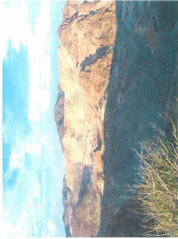
View of Vast Open Pits Of Morenci Mine