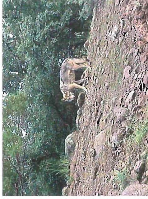
Mexican Wolf habitat restoration area

In Arizona, a fleeting glimpse of forest deer can be seen in a forest community in- between 3 to 10 feet. In Arizona, other common species to this forest community in-