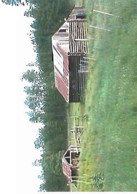
Old Ranch Buildings in Central Area of Corridor