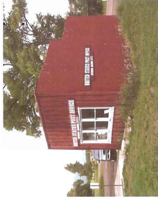
Nutrioso Post Office Built by WPA during the Great Depression

Springerville-Eagar area is located about eight miles away from the north end of the Coronado Trail Scenic Road. It was built in the middle of a volcanic field about the size of Rhode Island. The Springerville area was originally settled prior to 1871 by Mexicans who named the area "Valle Redondo" or Round Valley as it is known today. The original town site was called Omer by the Mormon settlers. Springerville was named for merchant Henry Springer