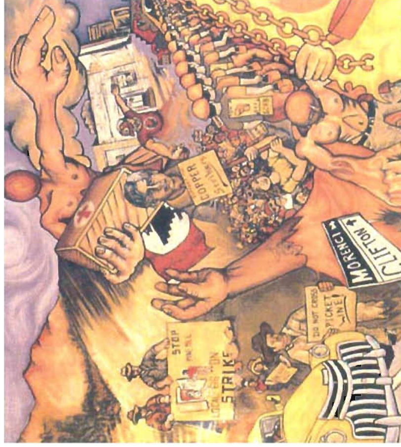
Reproduction of part of labor protest painting for the strike at Morenci in 1983

Mining operations in the Clifton-Morenci area have provided the context for several milestones in the history of labor-management relations. Principal among them are these: (a) the first American labor strike initiated by Mexican-American miners (June, 1903); (b) use of the National Guard to prevent the use of strikebreakers, and elimination of wage differences between Anglo and Mexican workers (September 1915-February 1916); and (c) rendering the strike ineffective as a bargaining tool in labor-management negotiations in the mining industry. (June 1983 – December 1985)