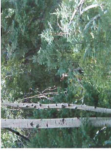
Fleeting glimpse of forest deer

Madrean Evergreen Woodland. In Arizona, this mild winter-wet summer woodland can be found in southeastern Arizona northward to Yavapai County. This woodland community is most commonly found in elevations of 4,000 feet to 7,200 feet in elevation. This community is characterized by evergreen oak, juniper, and pine trees.