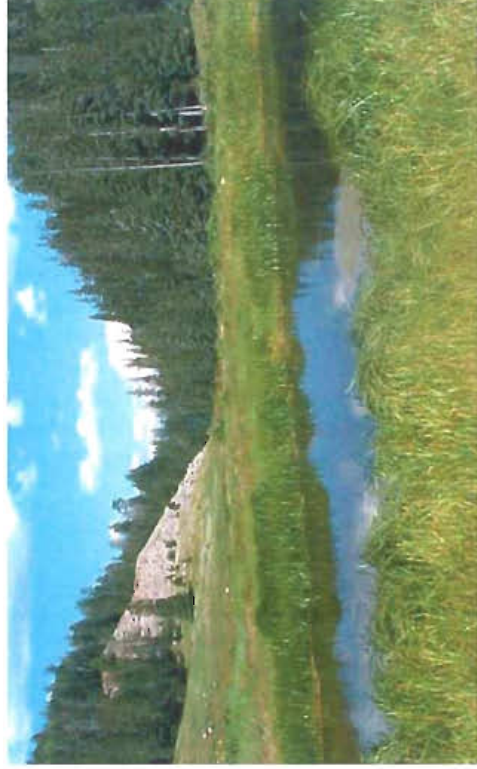
Quiet mountain meadows line northern reaches