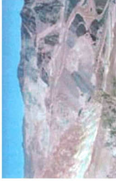
View overlooking part of the Morenci pit