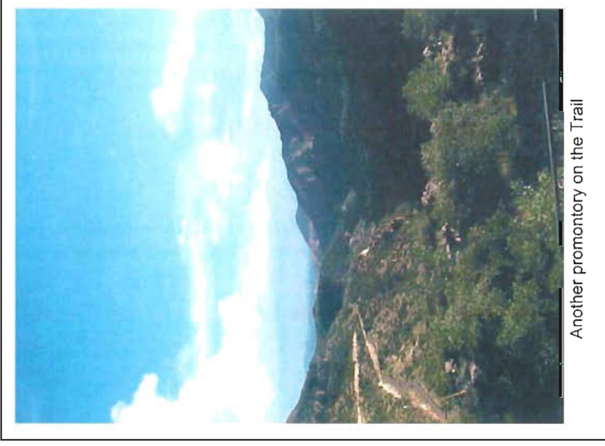
Another promontory on the Trail