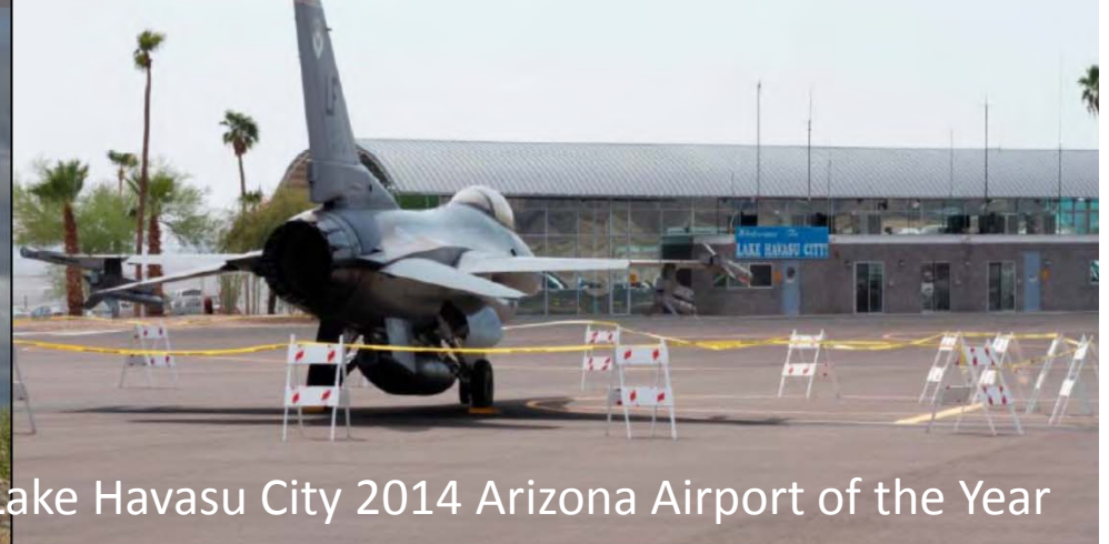
Lake Havasu City 2014 Arizona Airport of the Year