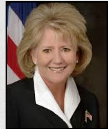
MARY E. PETERS FORMER U.S. SECRETARY OF TRANSPORTATION

Ms. Peters served as the Arizona Department of Transportation (ADOT) Director prior to becoming Federal Highway Administrator. She was appointed to serve as ADOT Director in 1998 by Governor Jane Hull, after making tremendous strides in many roles within the Department beginning in 1985.