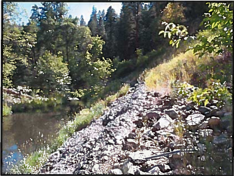
Figure 2. Project area, looking downstream.