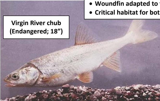
Virgin River chub (Endangered; 18")