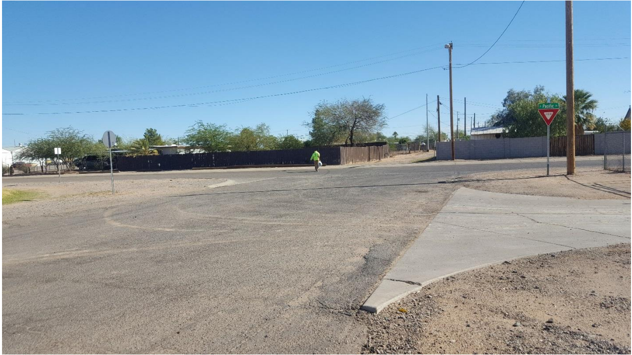
Central Ave east of tracks looking east