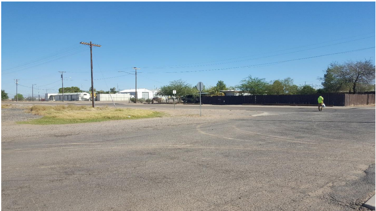
Central Ave east of tracks looking southeast