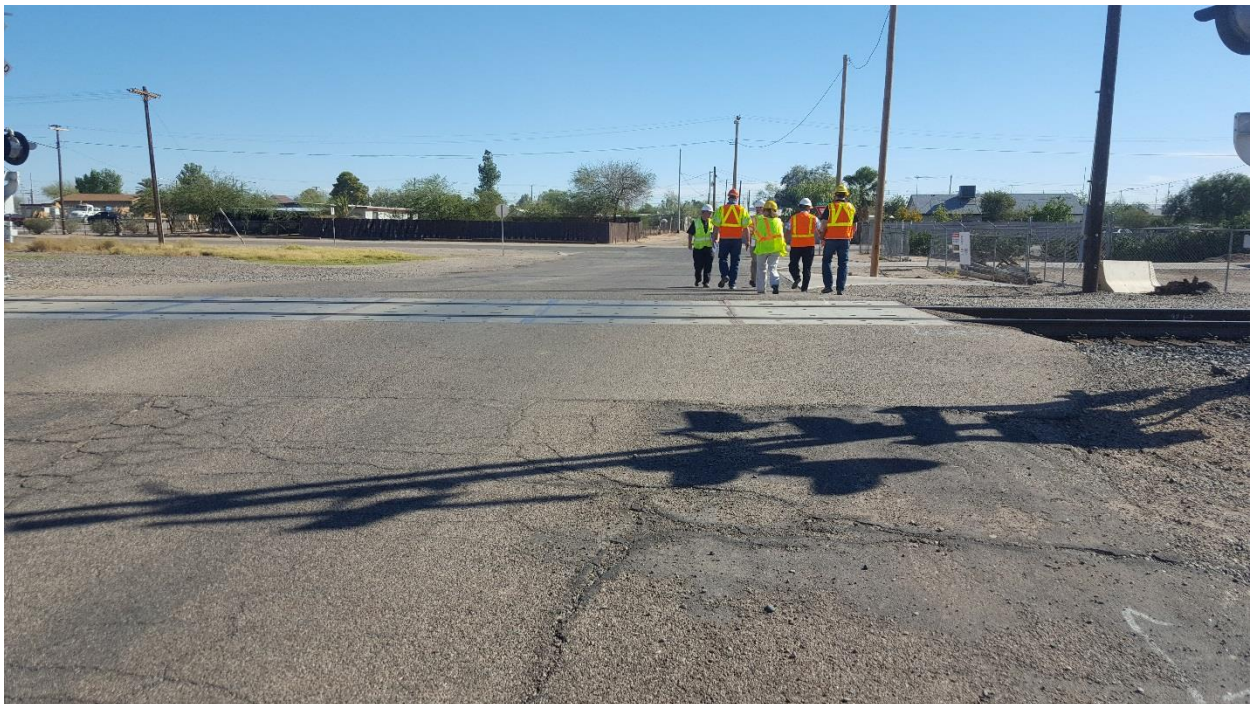
Central Ave looking east towards Pacific