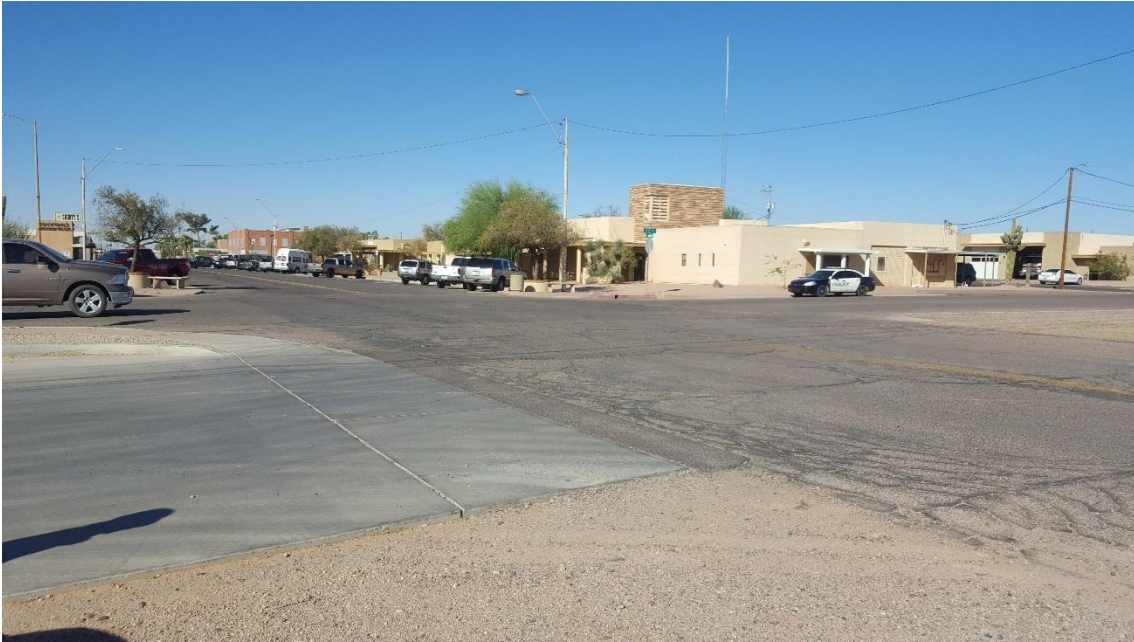
Central Ave looking west towards 1 st Street from north side of Central