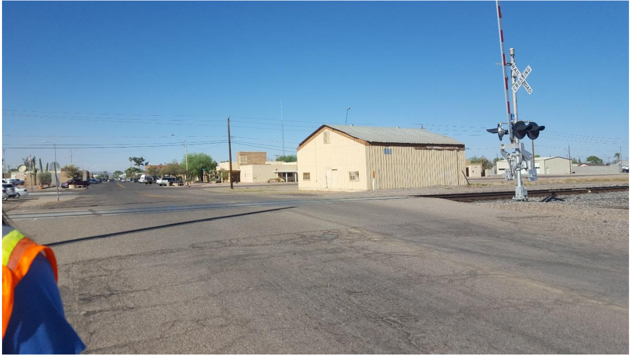
Central Ave east of tracks looking west