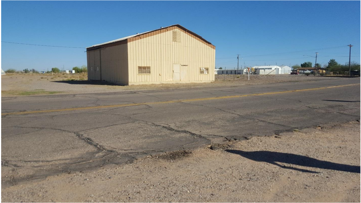
Central Ave looking s towards 1 st Street from north side of Central