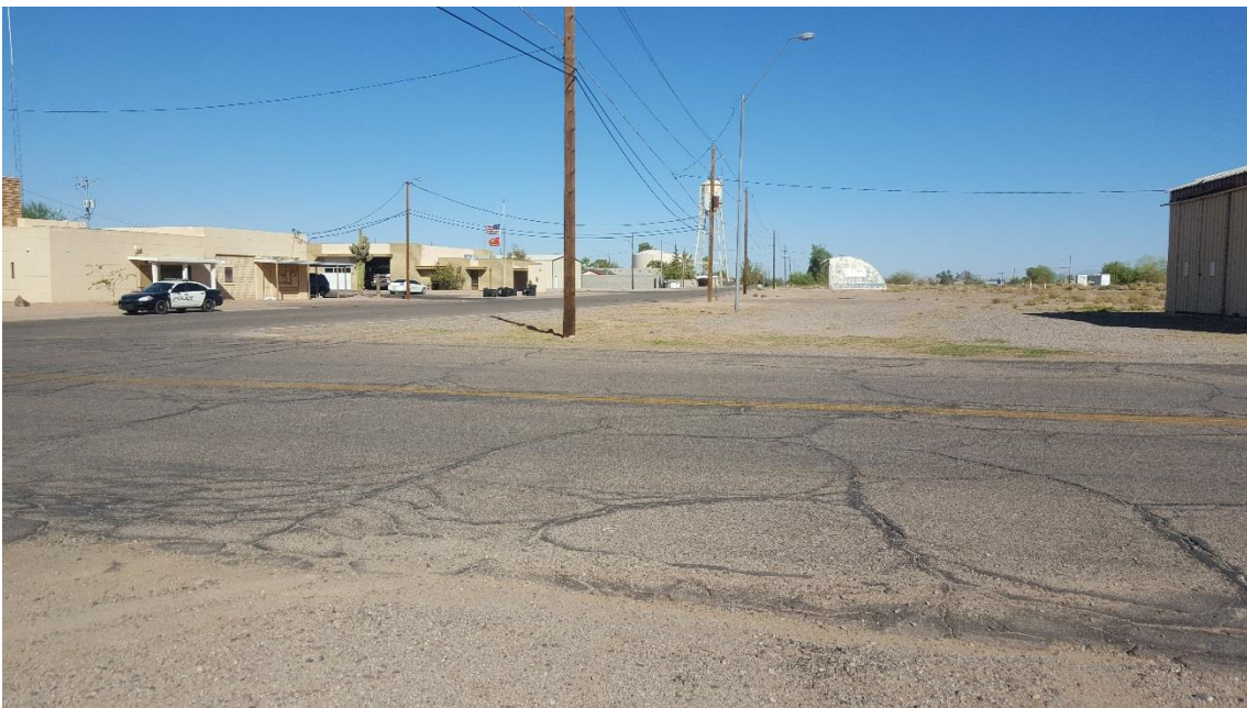
Central Ave looking south towards 1 st Street from north side of Central