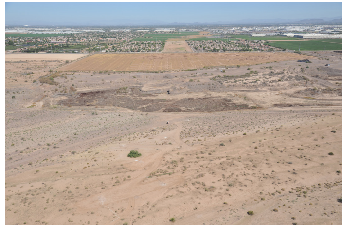
BEFORE: Looking north toward Salt River September 2016