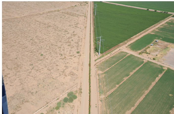
BEFORE: Looking north toward Estrella Drive September 2016