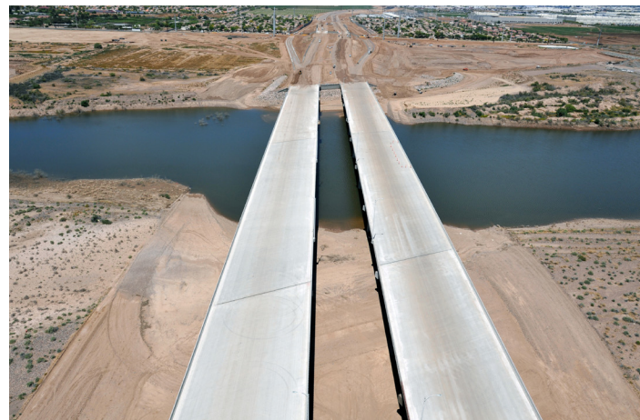
AFTER: Looking north at the bridges over the Salt River April 2019