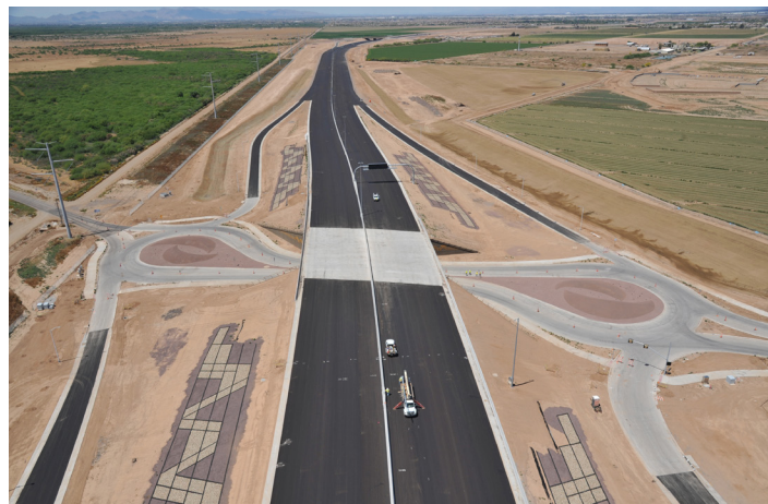
AFTER: Looking northwest toward the Estrella Drive interchange April 2019