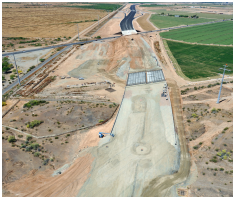
Dusty Lane looking west toward 51st Avenue April 2019