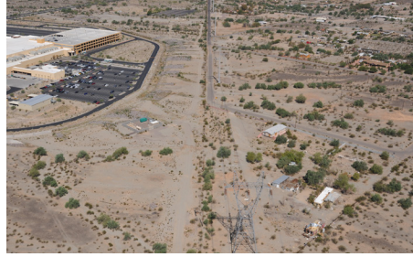
BEFORE: Dusty Lane looking north toward 51st Avenue September 2016