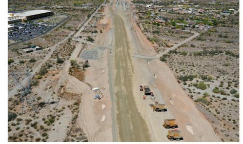
AFTER: Dusty Lane looking north toward 51st Avenue April 2019