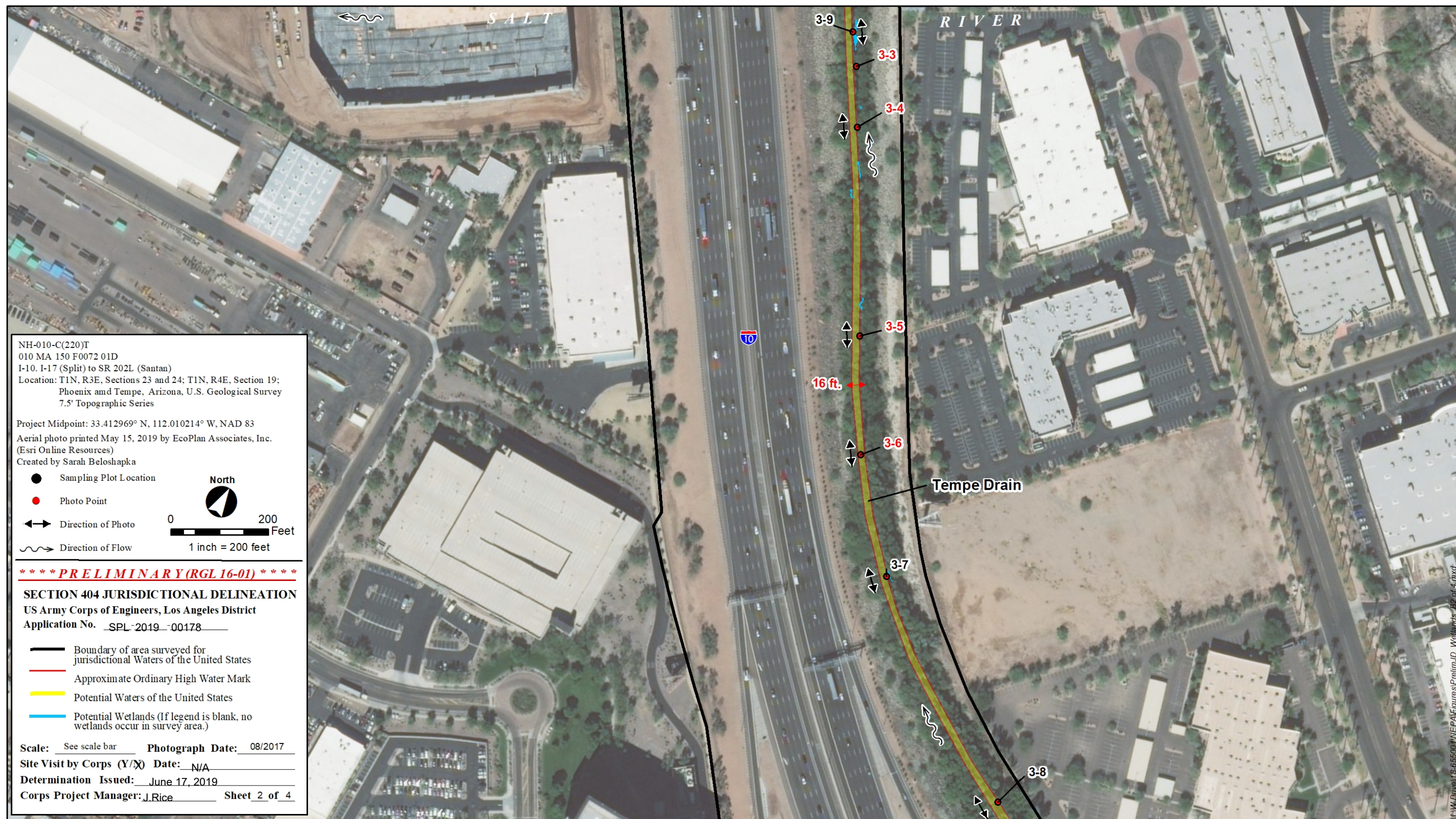
Figure B-1b. Proposed Waters of the United States Delineation with Wetlands (open water is yellow and wetlands are blue)

NH-010-C(220)T 010 MA 150 F0072 01D I-10, I-17 (Split) to SR 202L (Santan)