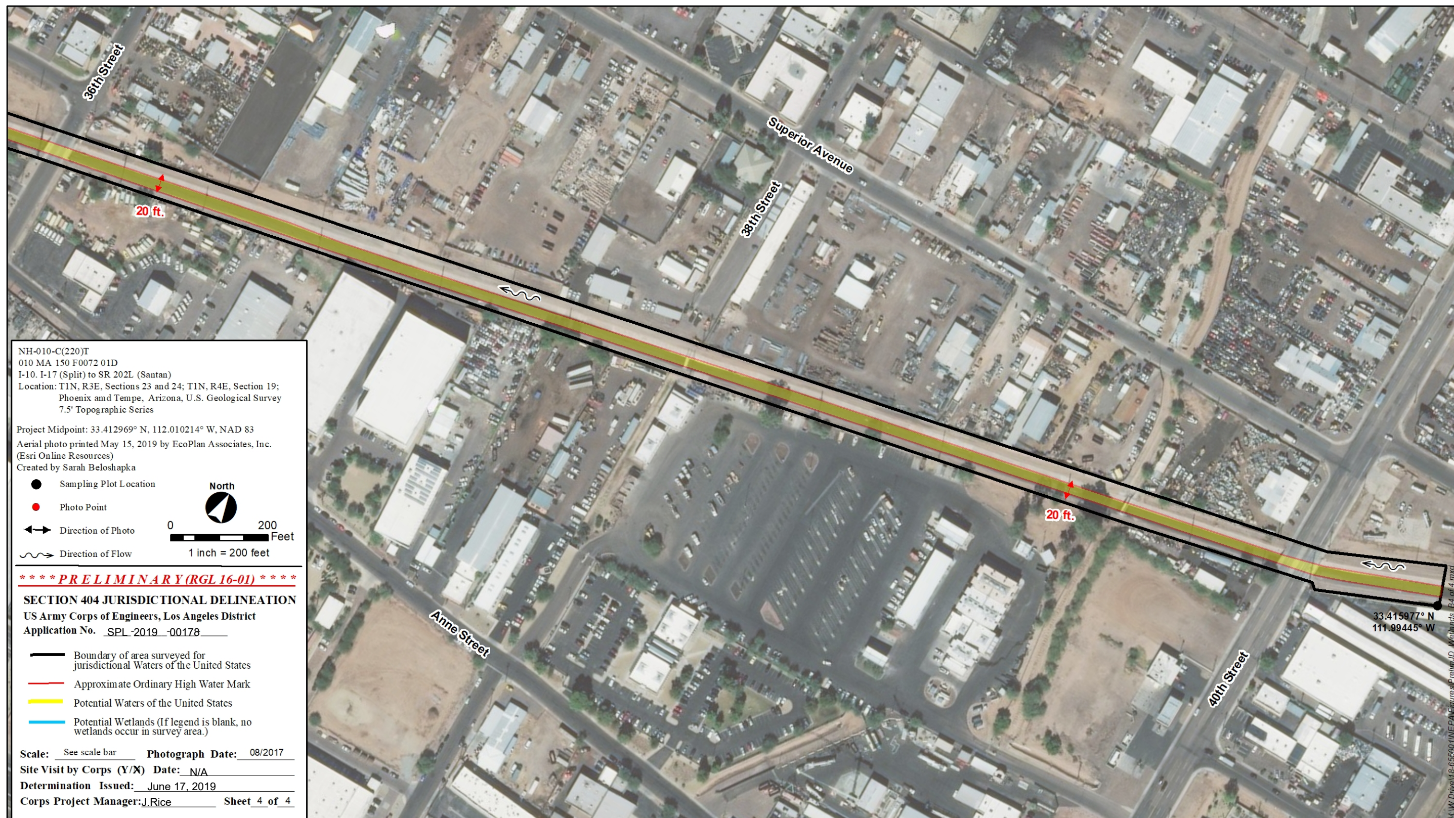
Figure B-1d. Proposed Waters of the United States Delineation with Wetlands (open water is yellow and wetlands are blue)

NH-010-C(220)T 010 MA 150 F0072 01D I-10, I-17 (Split) to SR 202L (Santan)