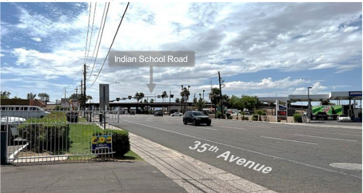
Figure 1a. Viewpoint 1 – Existing Conditions

Viewpoint north of Indian School Road along 35<sup>th</sup> Avenue, looking south along 35th Avenue at the existing Indian School Road bridge. Photo taken near 4235 N 35th Ave, Phoenix, AZ 85017.