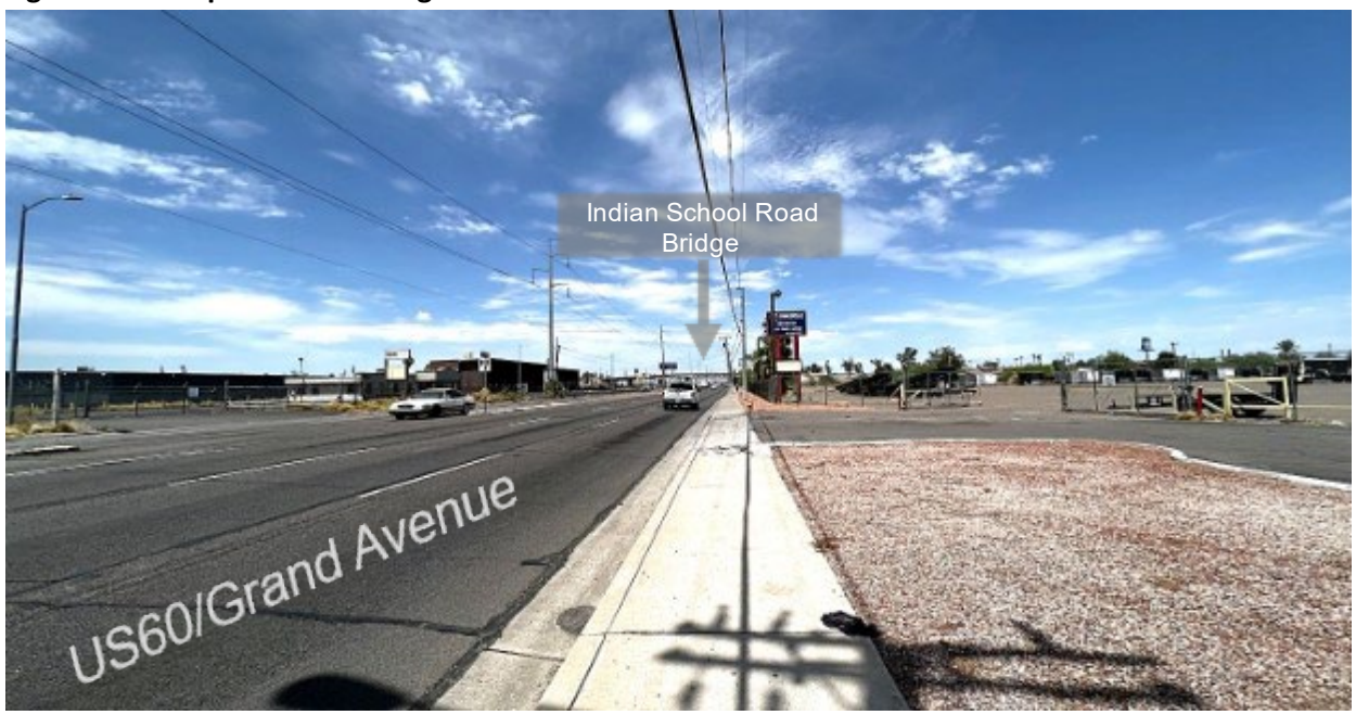
Figure 1e. Viewpoint 3 - Existing Conditions

Viewpoint south of Indian School Road along US 60/Grand Avenue, looking north along US60/Grand Avenue at the existing Indian School Road bridge. Photo taken near 3400 Grand Ave, Phoenix, AZ 85017.