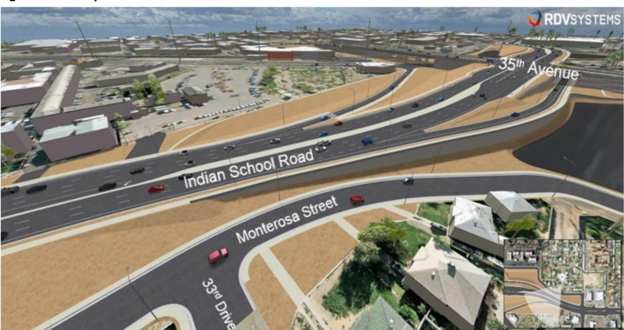
Figure 1d. Viewpoint 2 – Future Build Conditions

Viewpoint north of Indian School Road along 33<sup>rd</sup> Drive, looking south along 33<sup>rd</sup> Drive at the proposed Indian School Road/35<sup>th</sup> Avenue elevated intersection and Monterosa Street.