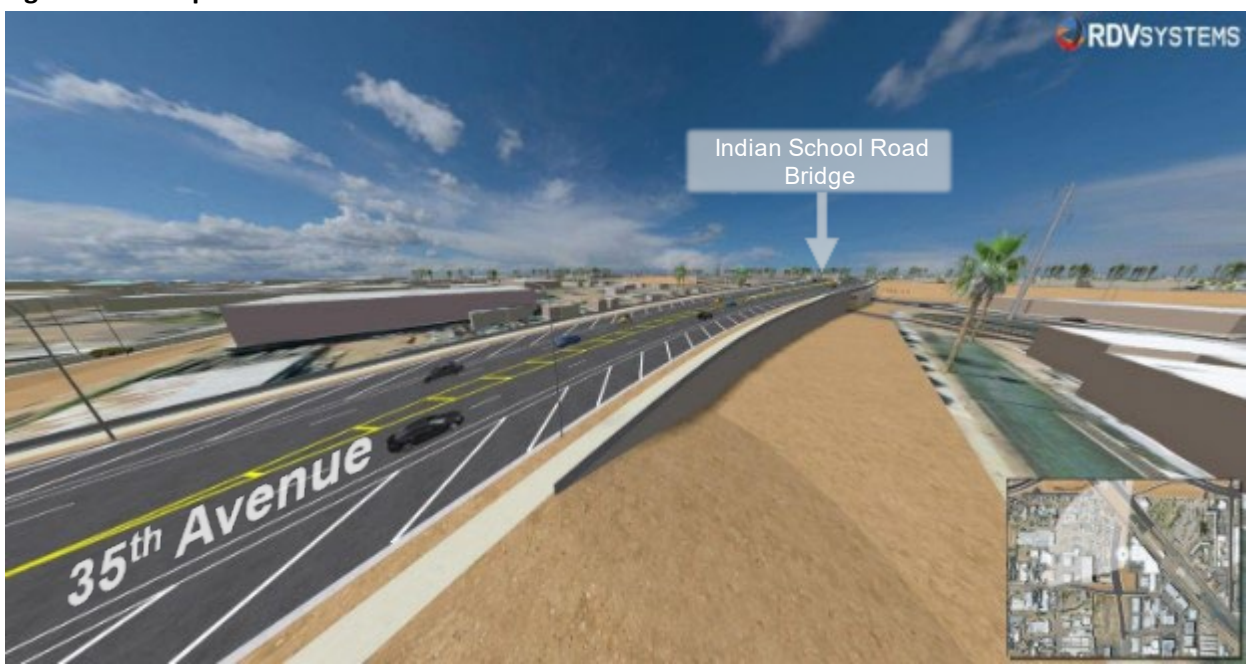
Figure 1h. Viewpoint 4 – Future Build Conditions

Viewpoint south of Indian School Road along 35<sup>th</sup> Avenue, looking north along 35<sup>th</sup> Avenue at the proposed Indian School Road/35<sup>th</sup> Avenue elevated intersection.