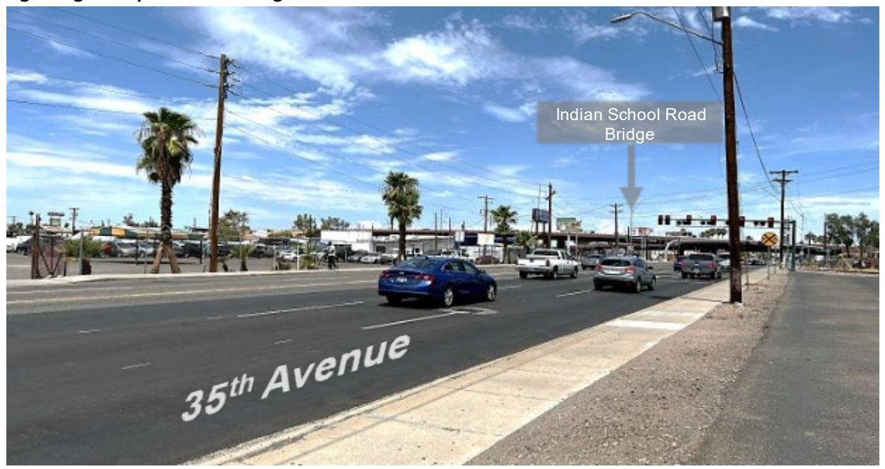
Figure 1g. Viewpoint 4 – Existing Conditions

Viewpoint south of Indian School Road along 35<sup>th</sup> Avenue, looking north along 35<sup>th</sup> Avenue at the existing Indian School Road bridge. Photo taken near 3839 N 35th Ave, Phoenix, AZ 85017.