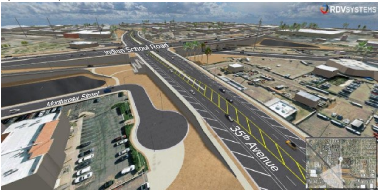
Figure 1b. Viewpoint 1 -- Future Build Conditions

Viewpoint north of Indian School Road along 35<sup>th</sup> Avenue, looking south along 35<sup>th</sup> Avenue at the proposed Indian School Road/35<sup>th</sup> Avenue elevated intersection.