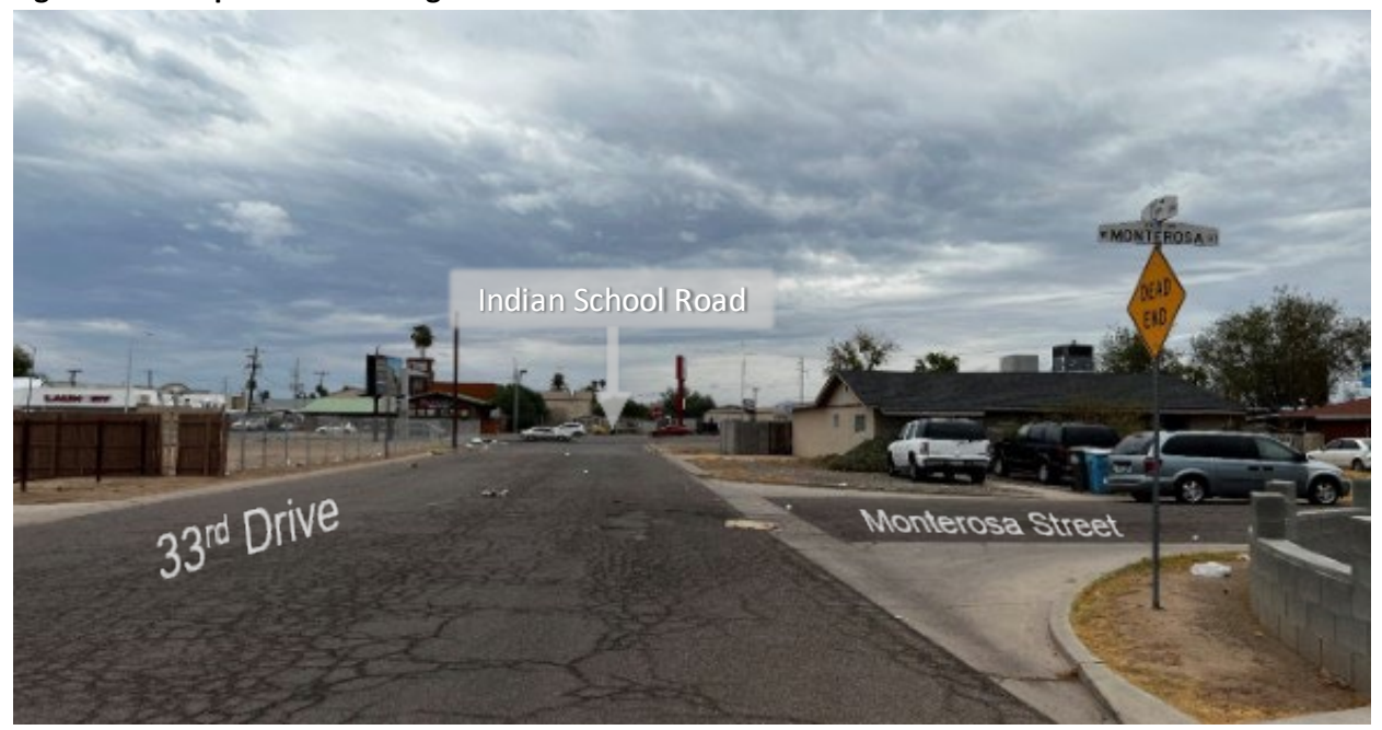
Figure 1c. Viewpoint 2 - Existing Conditions

Viewpoint north of Indian School Road along 33<sup>rd</sup> Drive, looking south along 33<sup>rd</sup> Drive at the existing residential properties and Indian School Road. Photo taken near 3332 W Monterosa St, Phoenix, AZ 85017.