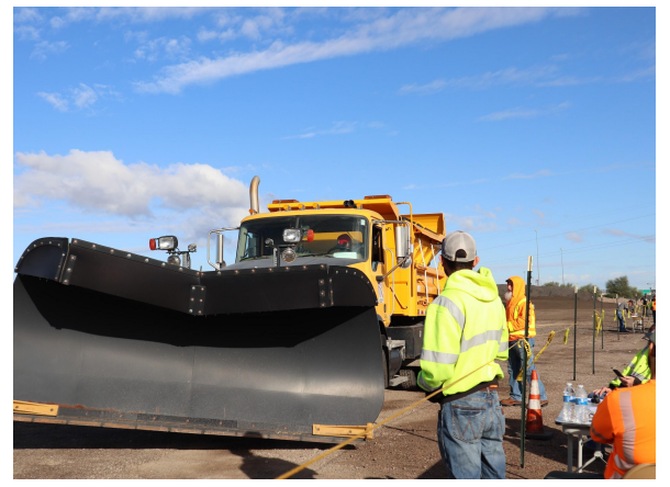
2024 Equipment Roadeo. Tucson, Az