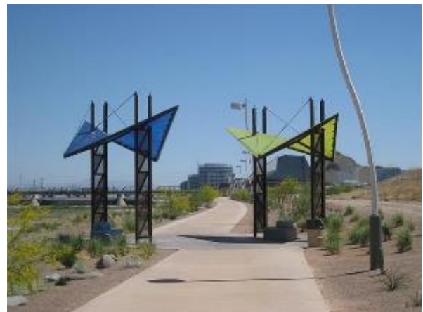
Paths and sidewalks are listed as qualifying for CEs in 23 CFR 771.117(c)

A specific list of actions that typically qualify under this category are described in 23 CFR 771.117(c) and are therefore known as “c-list” CEs. Per 23 CFR 771.117(c) these projects require limited documentation to demonstrate NEPA compliance. These projects are generally actions that are within the ROW of an existing roadway or require only minor amounts of new ROW. For example, bicycle paths and sidewalk projects are specifically listed under 23 CFR 771.117(c)(3) – “Construction of bicycle and pedestrian lanes, paths, and facilities.” Such projects are by definition a CE by way of matching the action to the description in the regulations.