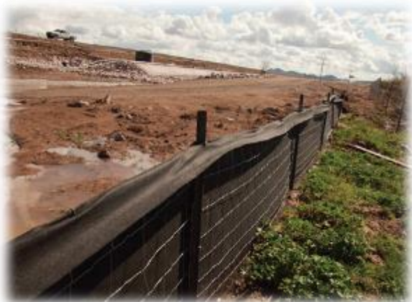
Environmental commitments come in many forms.

Project-specific mitigation measures should be limited to those impact mitigations that are not included in ADOT (or CA Agency as appropriate); standard specifications, stored or supplemental specifications, or other requirements that reside elsewhere in special provisions or project permit conditions. Project-specific mitigation measures are direct impact-related mitigations as derived from regulation and developed through environmental analysis or agreed upon with other agencies through consultation such as Section 7, Section 106 or Section 4(f) ( de minimis determinations or avoidance commitments). An example would be that access, construction notifications and maintenance of traffic are located elsewhere in project special provisions and/or standard specifications. However, a project-specific mitigation may be made that ADOT will fund a fire department’s request for additional fire-fighting support due to access limitations of existing fire-fighting services in a project area. Additional examples of project-specific mitigations could include; maintained access to a Section 4(f) property, archaeological data recovery prior to construction, archaeological avoidance areas, planting for a habitat impact, seasonal cutting restrictions, construction monitoring or use of in lieu fees for a wetland impact.