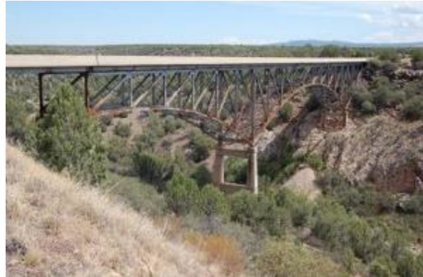
Bridge projects normally are processed with a CE.

All actions that qualify for a CE must be reviewed for unusual circumstances related to Section 106 and Section 4(f) [23 CFR 771.117(b)]. A preliminary review of the project scope identifies that the bridge is historic. One would make an initial determination that a CE under (c)(28) will likely be appropriate with additional environmental analysis required. Assuming the Section 106 process concludes that there is an “adverse effect” a Programmatic Section 4(f) Evaluation and Approval for FHWA Projects that Necessitate the Use of Historic Bridges would be completed. Since two of the 23 CFR 771.117(e) constraints would be exceeded the project would then be changed from a (c)(28) and documented as a (d)(13) CE and approved under the 326 MOU.