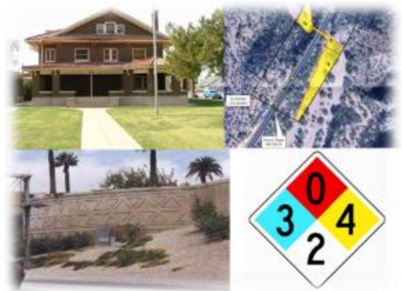
Unusual circumstances and other environmental laws are always considered.

Pursuant to 23 CFR 771.117(b)(2) “substantial controversy on environmental grounds” must be considered in the review of “unusual circumstances.” Substantial controversy is not equated with the inconvenience caused by temporary impacts such as temporary access restrictions during construction or a comment letter received that is critical of a project. Substantial controversy relates to a substantial amount of public or agency opposition to the permanent impacts of a project on environmental grounds (“...related to a substantial dispute as to the size, nature or effect...” – CEQ ). If there is substantial controversy on environmental grounds then additional documentation would be required to document that the project still qualifies for a CE.