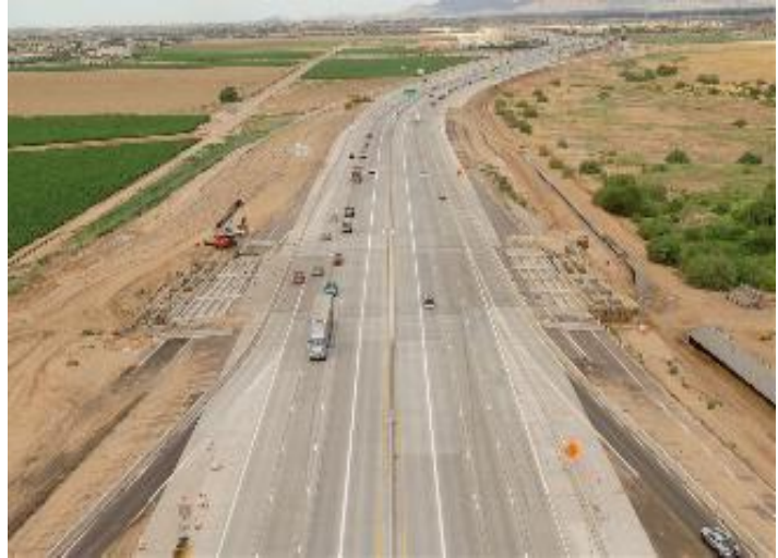
Some projects are individually approved as a CE though not specifically listed under 23 CFR 771.117(d)

23 CFR 771.117(d) lists examples of actions that qualify to be processed as a CE. Projects that qualify under this list are therefore known as “d-list” projects. Paragraph (d)(13) includes those projects that may start out as initially listed under (c)(26), (c)(27) and (c)(28) of 23 CFR 771.117 but are later determined through environmental analysis to not meet the constraints of 23 CFR 771.117(e). Also, as previously stated, these three CEs are the former (d)(1), (d)(2) and (d)(3) actions which are now listed as “reserved” in 23 CFR 771.117(d).