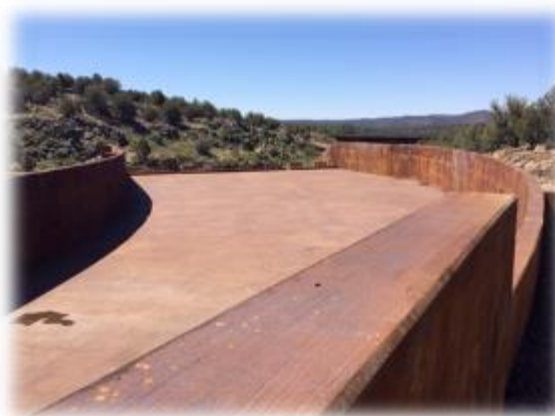
Example of mitigation for visual impacts.