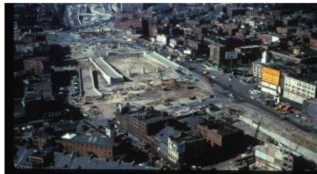
NEPA's focus is projects with significant impacts

Significance is defined for NEPA under 40 CFR § 1502.3 . The level of significance of an impact is determined by the context and intensity of an impact. Context relates to impacts in their setting and intensity relates to the severity of impacts. For example, the difference between three acres of wetlands impact in the arid Southwest as opposed to three acres of wetland impact in the Northeastern United States. Or a project with three acres of wetlands lost on a small-scale project vs. a large-scale project.