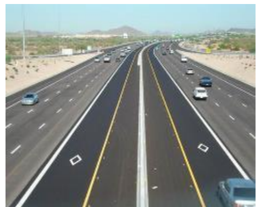
HOV lanes in an existing operational ROW

MAP-21 created new CEs under 23 CFR 771.117 paragraph (c) including (c)(22) for projects within the existing operational ROW and (c)(23) for projects receiving less than $5,000,000 of federal funds; or with a total estimated cost of not more than $30,000,000 and federal funds comprising less than 15 percent of the total estimated project cost . In 2015 the FAST Act provided for annual inflation adjustments. In 2021 the Infrastructure Investment and Jobs Act reset the dollar amounts to $6,546,000 and $38,185,000. These dollar amounts continue to be annually adjusted for inflation by FHWA. An arterial street widening that adds lanes could qualify for a (c)(23) CE if the total project cost met the criteria. A project such as HOV lanes in a highway median or general-purpose lanes within an existing