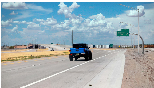
SR-24 expansion project, servicing Queen Creek, Mesa, and the greater southeast Valley