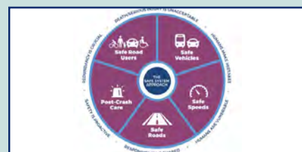
ADOT updates state's strategic plan to enhance roadway safety