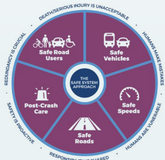
Safe System Approach (U.S. Department of Transportation)

For more information, please visit azdot.gov/SafetyPlan .