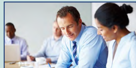
Nail the close: How to wrap up your presentation and inspire action

To learn more about ADOT DBE Supportive Services, please visit azdot.gov/DBE .