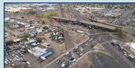
Two Arizona road projects receive federal funding