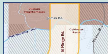
Survey for El Mirage Road extension goes live