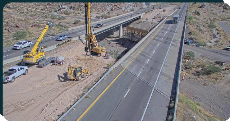
Progress on Clack Canyon Road Bridge widening is underway.