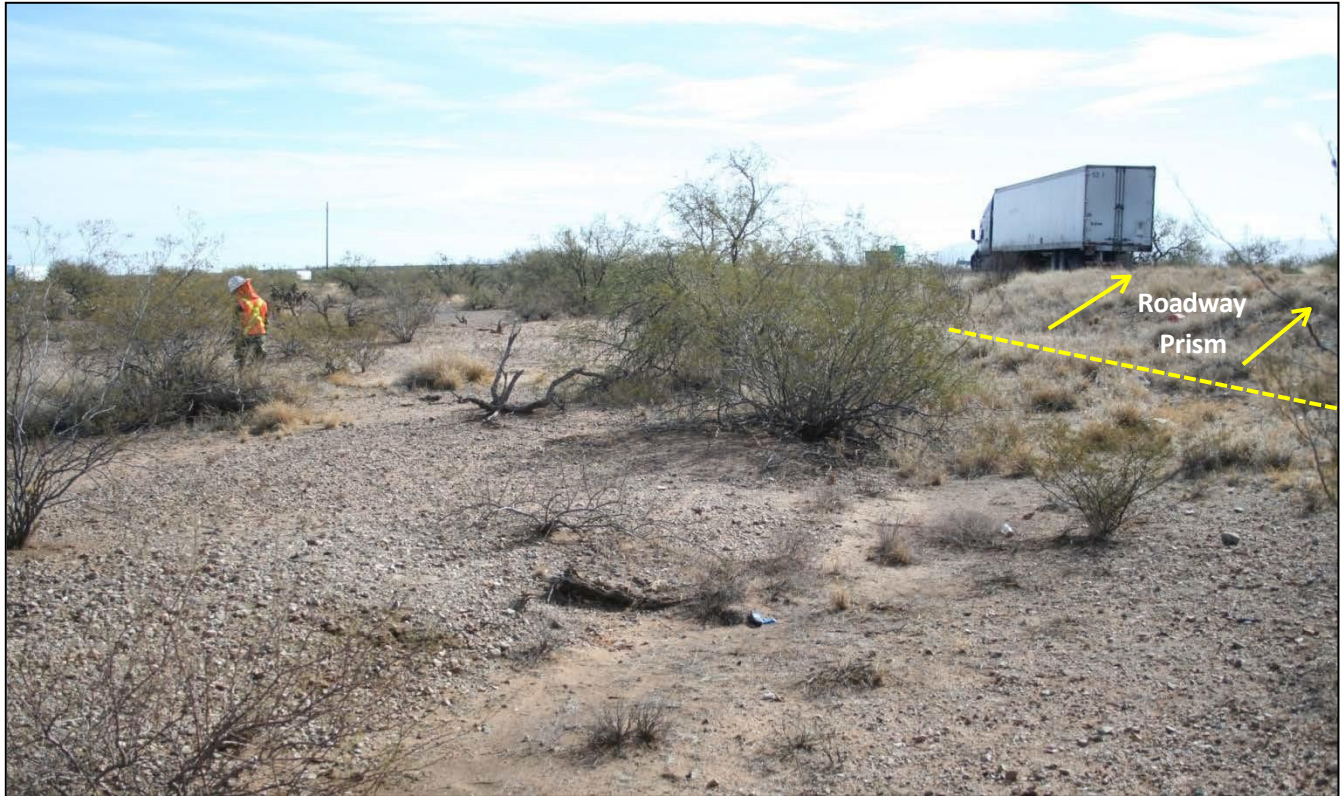
Figure 2. The person in this photo is outside of the previously disturbed roadway prism. The fill slope for the road, presence of desert pavement and creosote bushes which pre-date construction of the interstate, are all indicators of the location of the road prism. The road prism ends near the base of the fill slope, as indicated by the yellow line.