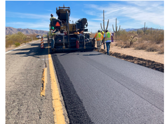
Unit 4592 Paving SR 86 MP 80 to 90