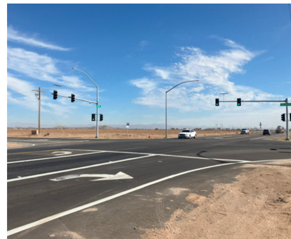
SR 87: New Traffic Signaled Intersection at Skousen - Unit 4593

I-10: Kino And Country Club TI F056401C (Design Build) Widening/ New TI's, $600,000,000.00 Sundt/Jacobs