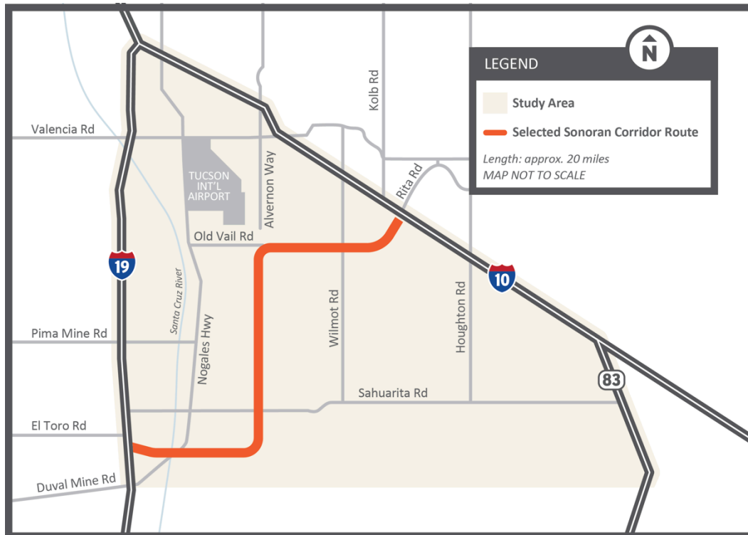
Figure 1: Study Area Map