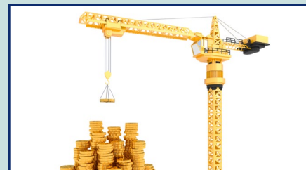
Worth every penny