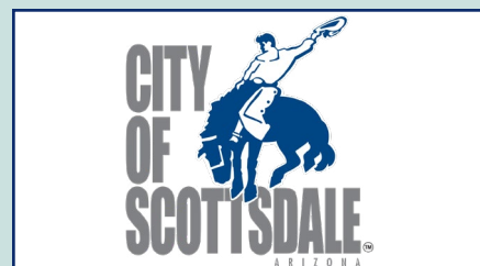
Scottsdale establishes Transportation and Infrastructure Department