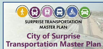
Surprise launches Transportation Master Plan process