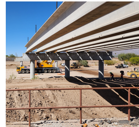
Unit 4591 Sunset Links Bridge over the Rillito River