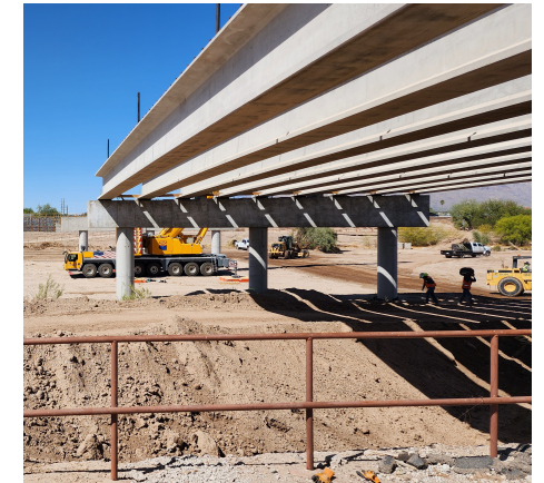
Unit 4591 Sunset Links Bridge over the Rillito River