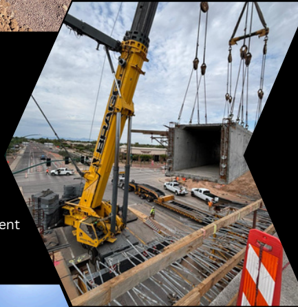
51st Ave Girder Placement