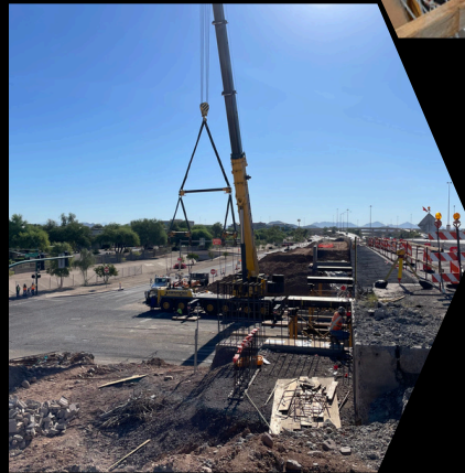
31st Ave Bridge