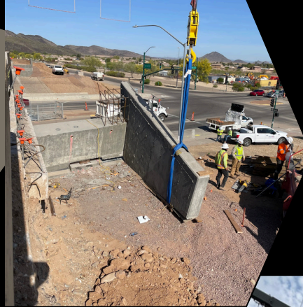
35th Ave Abutment Repair Operation

Central District boasts an exemplary record for accommodating special events like Super Bowls and NCAA Final Four events, all while having the highest traffic volumes in the State. Central District also plays a key role in handling all kinds of extreme weather. This ranges from plowing snow on SR-87 in partnership with the NorthCentral District to dealing with the extreme heat and monsoon storms in the summer.