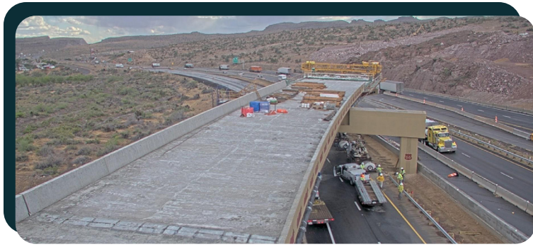
Construction of the new south-to-east flyover bridge over I-40 is progressing.