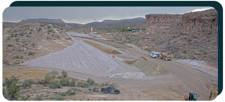
Work progresses on the new one-mile extension of US 93 that will connect US 93 and I-40 together.