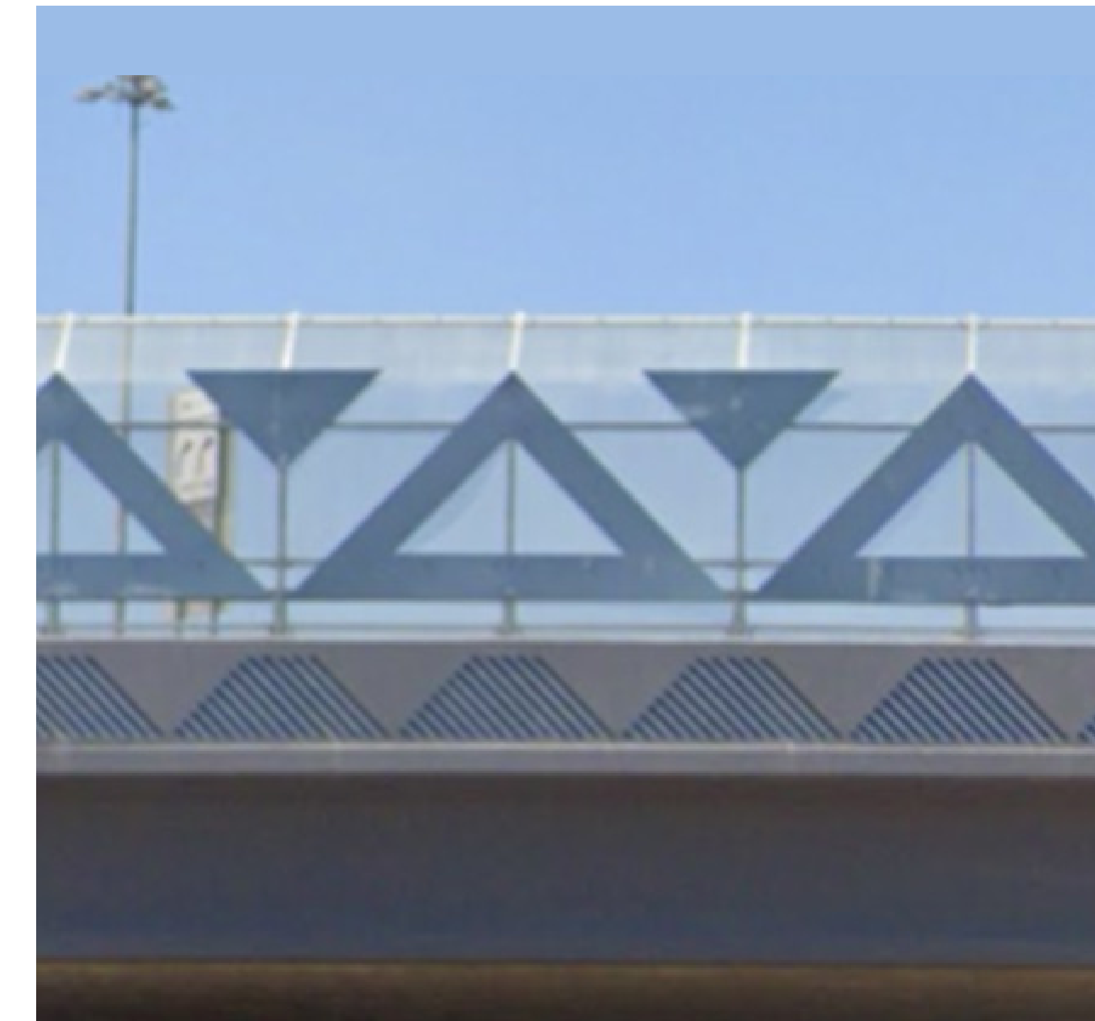
PEDESTRIAN FENCING Triangle Concept (from the Ajo Traffic Interchange) will be used on the new pedestrian fencing.