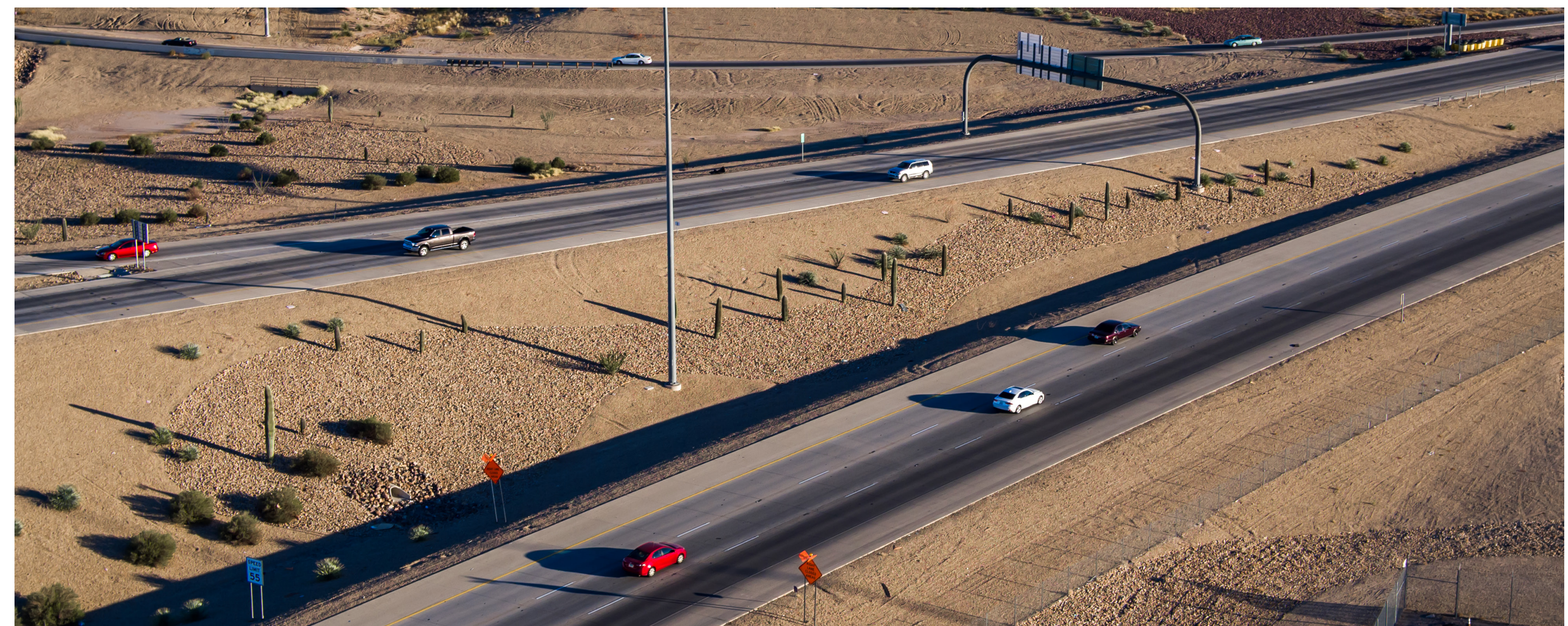
DESERT LANDSCAPING Desert Landscaping (similar to the I-10/I-19 Traffic Interchange) will be included as part of this project.