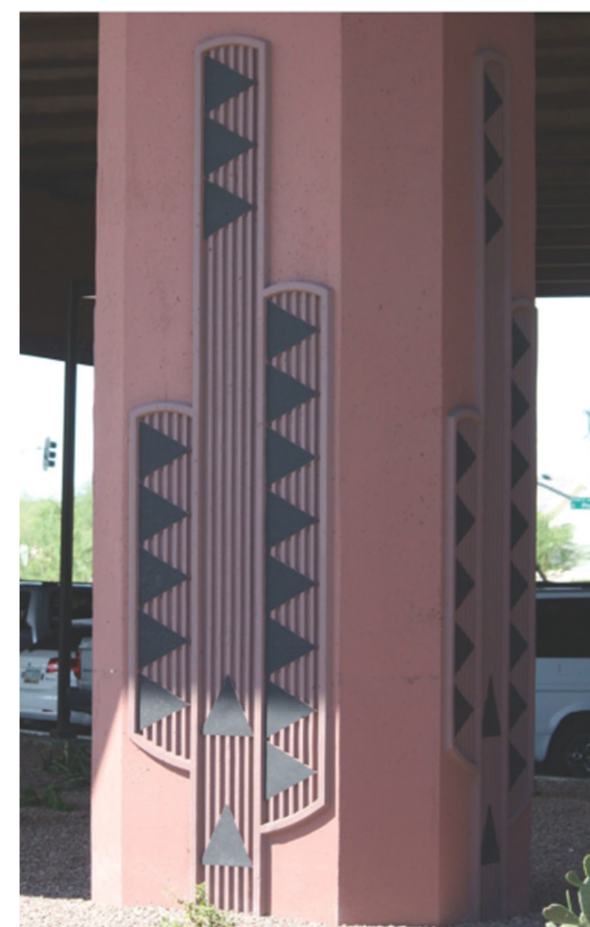
BRIDGE PIERS Saguaro Concept will be used on the new bridge piers.