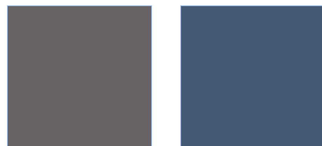
PAINT COLORS Same paint colors used on the Ajo Traffic Interchange will be used on this project.