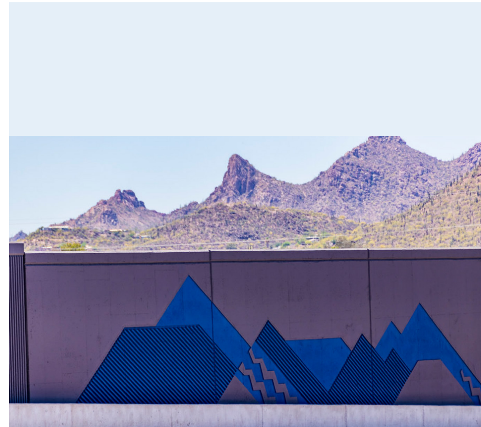
RETAINING WALLS Mountain Concept (from the Ajo Traffic Interchange) will be used on the new retaining walls.