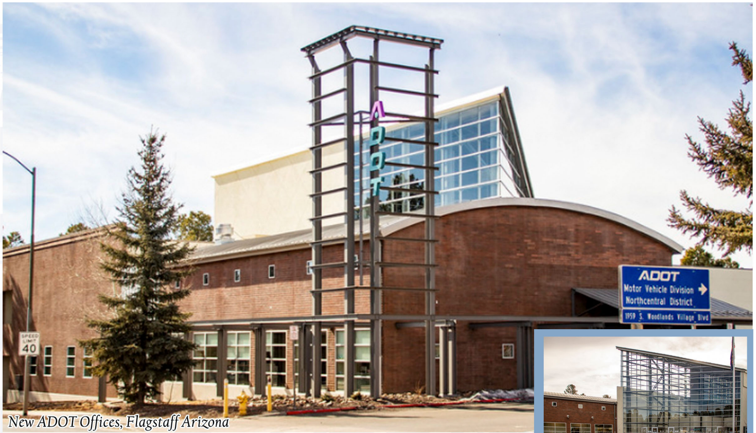
New ADOT Offices, Flagstaff Arizona