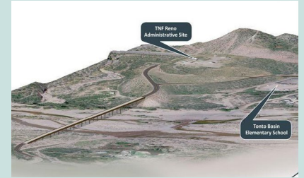
SIMULATION LOOKING WEST