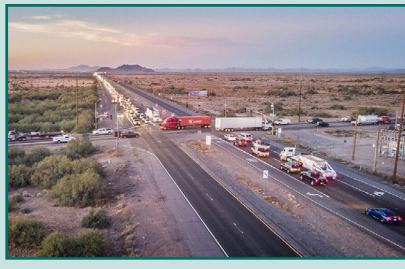
House Approves $35M for SR 347 Overpass