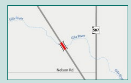
Governor Ducey, ADOT Advance $230M in New Transportation Investments

The funding plan is in partnership with the Arizona Department of Transportation and follows formal action by ADOT 's Priority Planning Advisory Committee . The proposal now will go before the State Transportation Board for consideration.