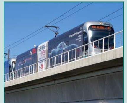
4/19 Deadline for ADOT Rail Plan Comments