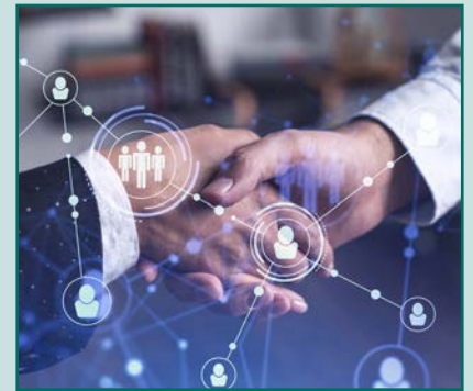
Master Networking Icebreakers: Review your IQ