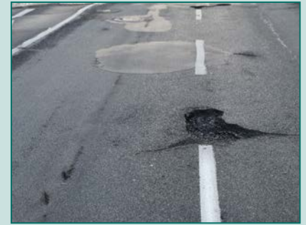
Pima Funds Repairs for Worst Roads