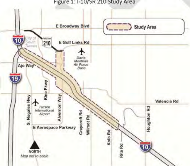
Figure 1: I-10/SR 210 Study Area

The Arizona Department of Transportation (ADOT), in conjunction with the Federal Highway Administration (FHWA), is conducting Phase II of a study to determine how best to improve mobility along Interstate 10, between the intersection with Interstate 19 to Kolb Road, southeast of downtown Tucson (Figure 1). Another major component of this study is to identify a new alignment of State Route (SR) 210 (Barraza Aviation Highway) that would connect with I-10 east of downtown.