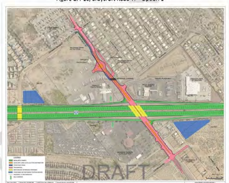
Figure 2: I-10/Craycroft Road TI - Option 1