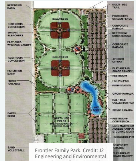
Frontier Family Park.

Despite the long list of town projects and the drive to complete them, officials say they are hampered by the same constraints everyone else is facing – namely supply chain constraints and skilled labor availability. While they say those issues are not necessarily slowing progress, the need for precise planning and execution has become paramount. ( Source )