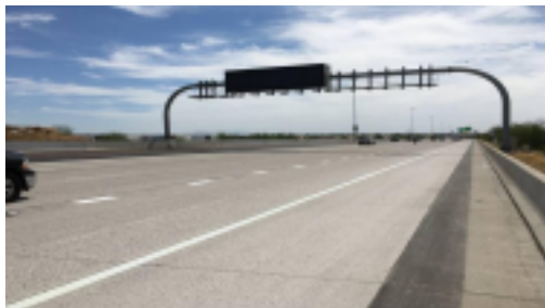
Diamond Grinding completed on L-202 Santan with District Maintenance funds